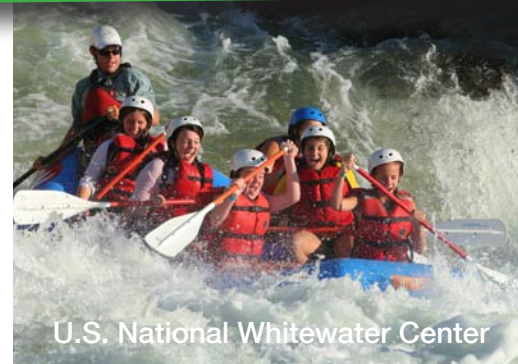
U.S. National Whitewater Center