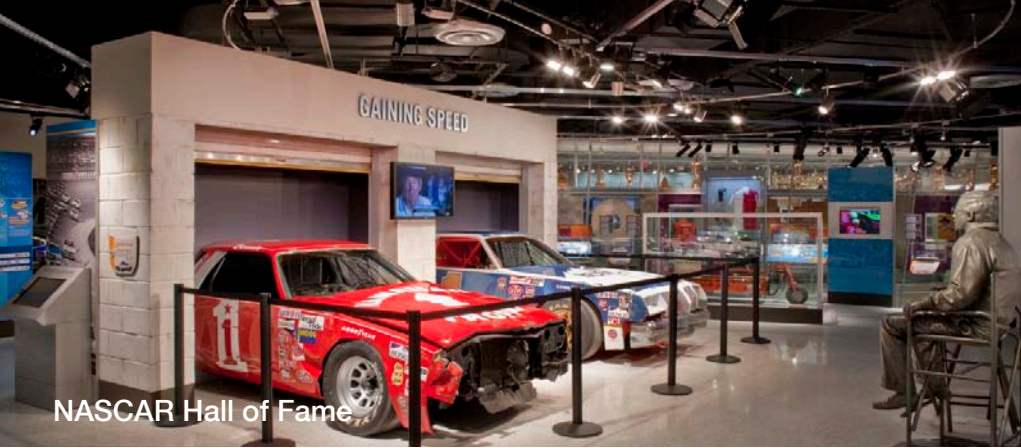
NASCAR Hall of Fame