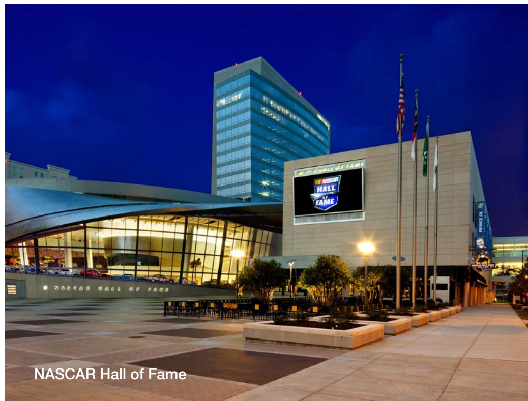
NASCAR Hall of Fame