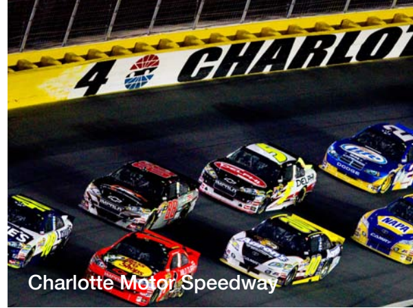
Charlotte Motor Speedway