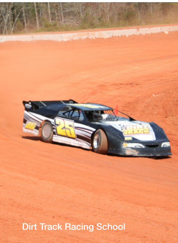
Dirt Track Racing School

Charlotte's got a lot. charlottesgotalot.com